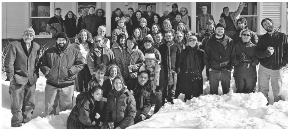
February 2007 VSC Residents

Vermont Studio Center • 80 Pearl Street, P.O. Box 613 • Johnson, Vermont 05656 U.S.A. p: 802-635-2727 • f: 802-635-2730 • email: info@vermontstudiocenter.org • web: www.vermontstudiocenter.org