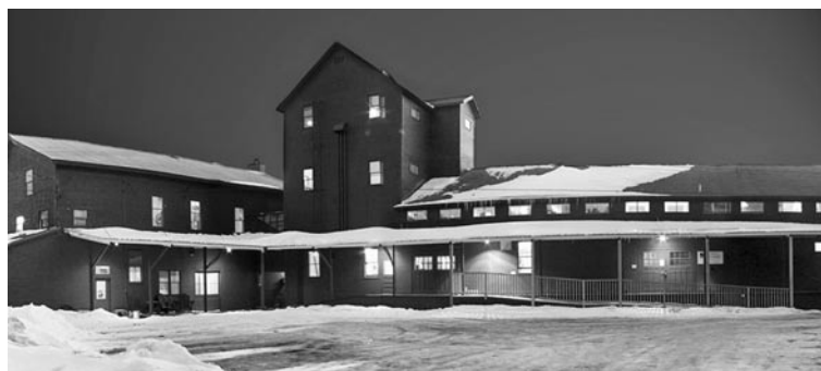
VSC Red Mill