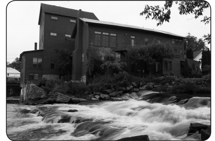
Red Mill, Vermont Studio Center

For more information, please visit www.vermontstudiocenter.org